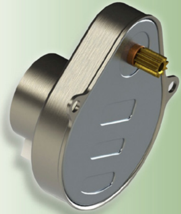
Series 125 Shallow Pear Model