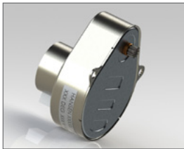
Series 125 Deep Pear Model